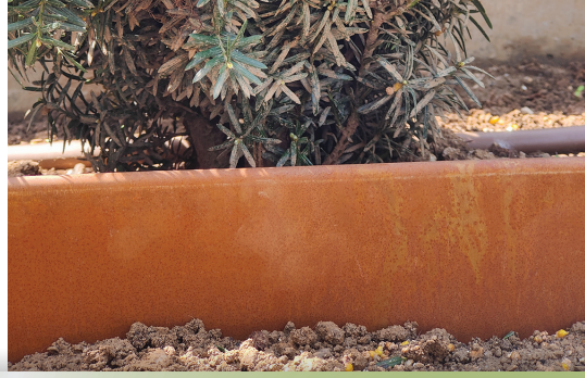
The CORTEN material will weather within a few weeks after installing providing a rustic look as above.