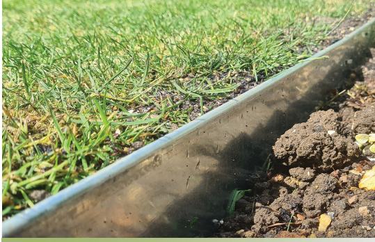
Steel colour when supplied and installed